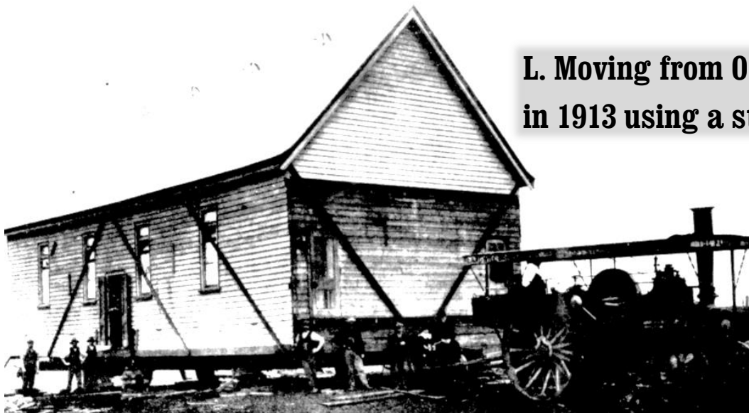
L. Moving from Old Cororooke in 1913 using a steam engine.

All these things will not happen at once we need to get our hands on quite a bit of money to achieve all this. Our markets and other activities only allow us to maintain the Hall & do minor repairs. For this project we are chasing grants and hopefully some corporate sponsorship. Whatever the means we are well & truly committed to the "new" Hall. When all these are achieved we have a little "icing" on the "cake". We have an historic stained glass window which came from the Alvie Hall to replace the front facing window on the back section of the northern side.